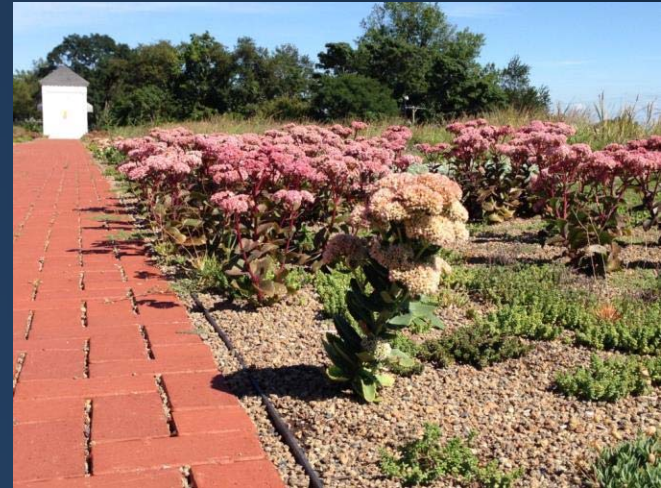
Green Roof on DC Water's Fort Reno Reservoir